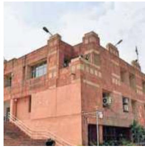
The panel had submitted its report on the JNU stand-off last week. FILE PHOTO

The panel, which comprises former University Grants Commission (UGC) chairperson V.S. Chauhan,